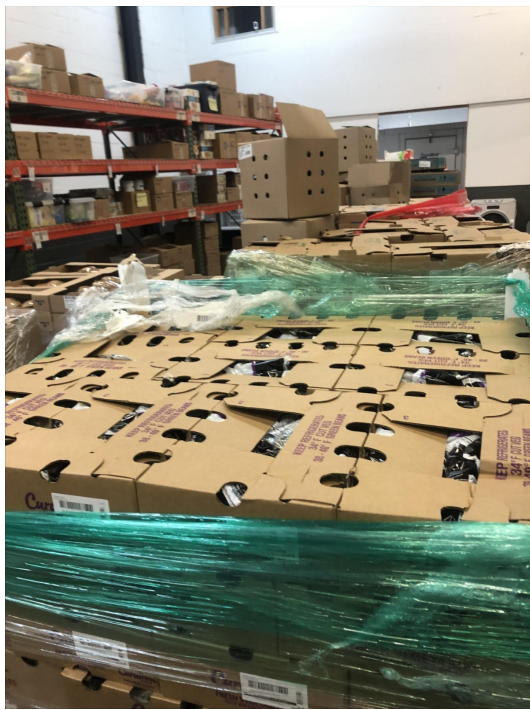
Table to Table is a community-based food rescue program that collects perishable food that would otherwise be wasted, and delivers it to organizations that serve the hungry in Bergen, Essex, Hudson and Passaic counties.