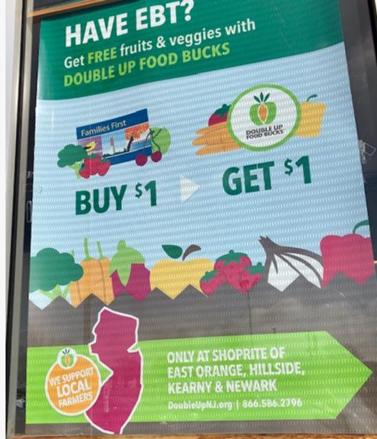
A poster for the Double Up Bucks Program hangs in the window at Hillside Shop Rite.